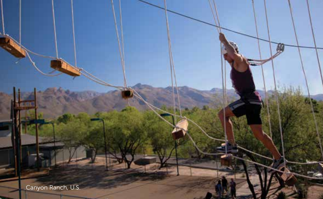
Canyon Ranch, U.S.

Spas like Canyon Ranch are using high-adrenaline challenges as a way of overcoming fears, letting go of bad “baggage” and jumping into a healthier future. The most stressed, vacation-starved nations (like the U.S. or Asian countries) crave the extreme adventure and relaxation cocktail most.