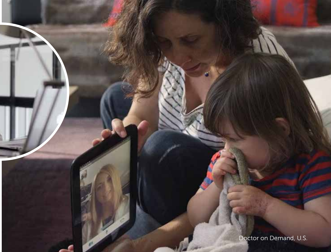
Doctor on Demand, U.S.