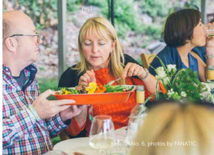
Festival No. 6

In the UK, Festival No 6 celebrates every facet of dance music, from parties in the woods to big tent headliners, along with healthy food, arts and culture.