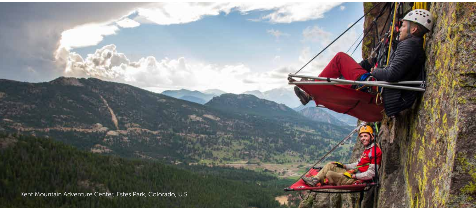
Kent Mountain Adventure Center, Estes Park, Colorado, U.S.

The most extreme wilderness experience may be cliff camping.