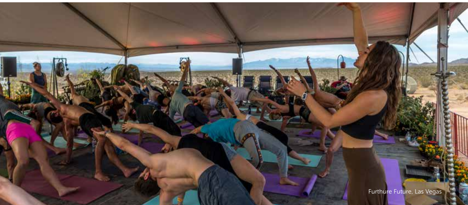
Furthure Future, Las Vegas

At last year's inaugural Furthure Future festival the amenities included a members-only spa, fine dining, and mini-TED talks on hacking your own consciousness.