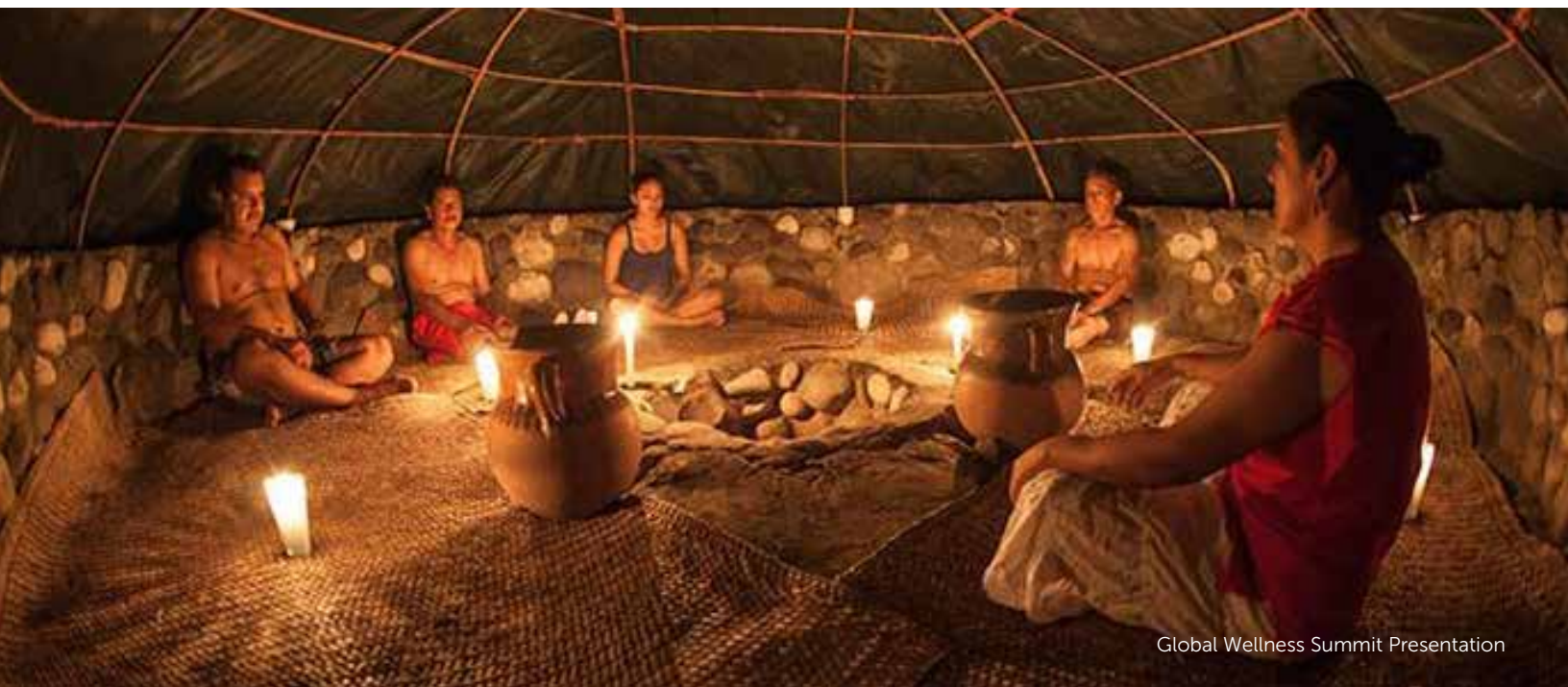
Global Wellness Summit Presentation

The Temazcalero or Mexican Shaman is the physical and spiritual guide that performs the ritual and looks over the participants, helping them to reach a personal and profound experience.