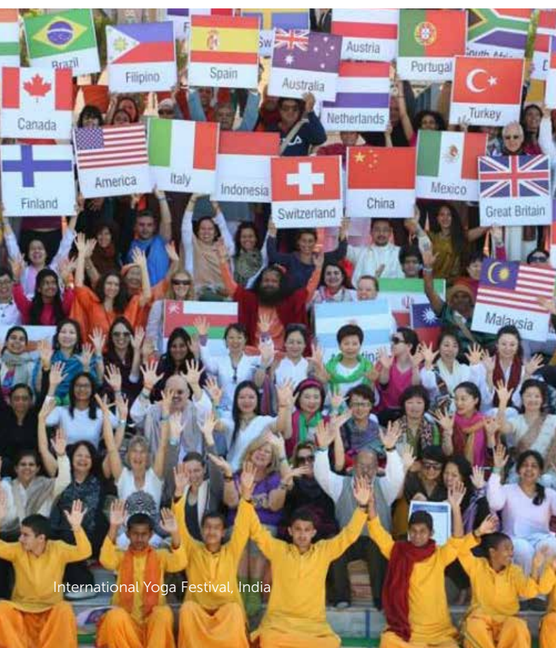
International Yoga Festival, India

Please give credit to this report when quoting or referring to one of the trends. © 2016 Spafinder Wellness, Inc.® All Rights Reserved. Information, data and visuals extracted from this report are to be accompanied by a statement identifying Spafinder Wellness, Inc. as the publisher and source.