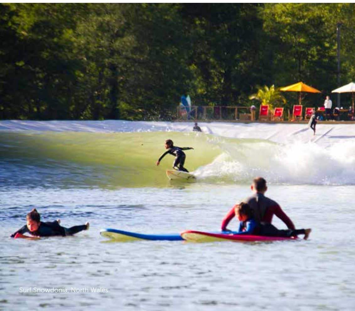
Surf Snowdonia, North Wales

Tooling down the California or Australian coast you see hordes of boys and girls in surf schools/gym classes. It's the new ballet class or tennis camp, and that will grow globally. More people will get introduced to