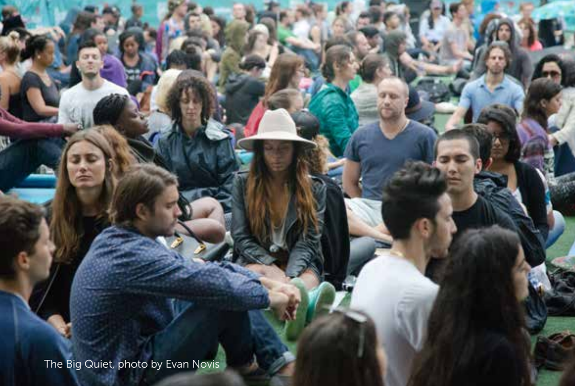
The Big Quiet

The Big Quiet , a brief group meditation session held in New York's Central Park, drew a crowd of over 1,000 in its first year. Five minutes of instruction were followed by 15 of stunning quiet, and then—more than an hour of dancing to soul and afro-Cuban beats.