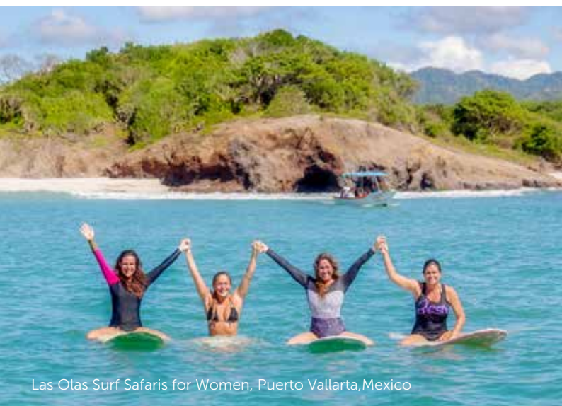
Las Olas Surf Safaris for Women, Puerto Vallarta, Mexico

The era of surfing as a Boys' Club is over, and so many more resorts and camps are now focused on making surfing less intimidating for women/girls, with retreats typically blending a whole lot of yoga, healthy food, beauty, fitness, self-empowerment and social fun into the surfing mix. Unexpected brands are even getting into the women's surf + wellness retreat mix: trendy clothing company, Free People, this week launched FP Escapes at Xinalani Eco-Resort (Yelapa, Mexico) with surf classes, star yoga and healthy eating instructors, and women's empowerment workshops (Hawaii and Spain look to be their next destinations).