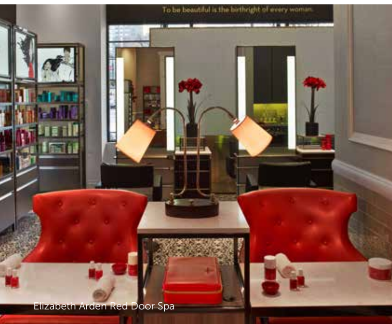
Elizabeth Arden Red Door Spa

Veluxe straddles the line between fitness and beauty, providing yoga and personal training on their list of services right alongside blowouts and updos. Even sports celebrities are getting in on the action, with tennis star Ana Ivanovic having recently launched the on-demand fitness app Trainers4Me to connect customers with personal trainers anywhere in the world. All of these apps provide customers with the opportunity for a guided, professional workout far from the noise and crowds that turn many off a trip to the gym.