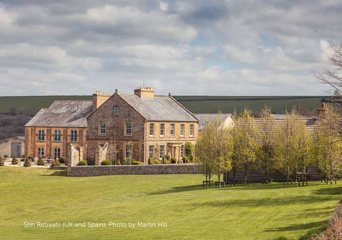
Shh Retreats (UK and Spain).

Shh Retreats , held in gorgeous country estates in the UK and Ibiza, Spain (and reportedly coming soon to the U.S.), are women's-only retreats, led by a team of practitioners (from sex therapists to pelvic floor health specialists) that take a no-holds-barred dive into improving women's libido and sexual pleasure.