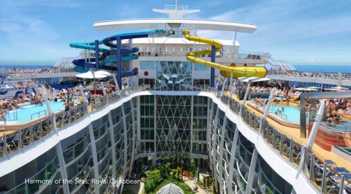
Harmony of the Seas, Royal Caribbean

Royal Caribbean's Harmony of the Seas targets younger cruise-goers with exciting elements such as rock climbing, zip lining, and multistory water slides.