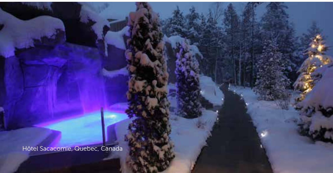
Hôtel Sacacomie, Quebec, Canada

At Hôtel Sacacomie guests can try James-Bondesque “ice driving,” and take a Porsche (with studded tires) out for a 150 mph “spin” across a frozen lake (along with dog-sledding and snow tubing) and then hit the toasty Geos Les Bains spa with underground saunas and steam baths.