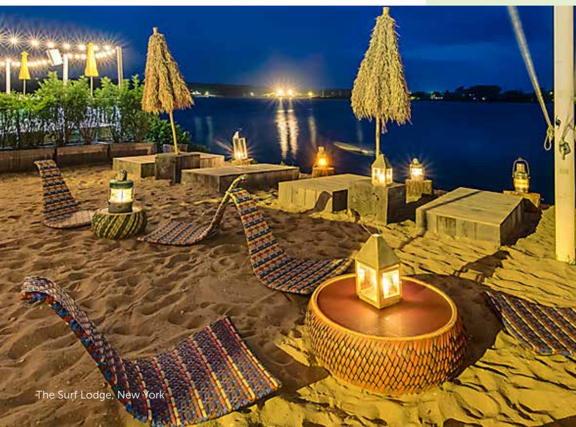
The Surf Lodge, New York

Surfing is hot on the "other" coast, from Maine to North Carolina. The Surf Lodge (Montauk, New York), combines farm-to-table cuisine, a roster of star-taught fitness classes and surf lessons.