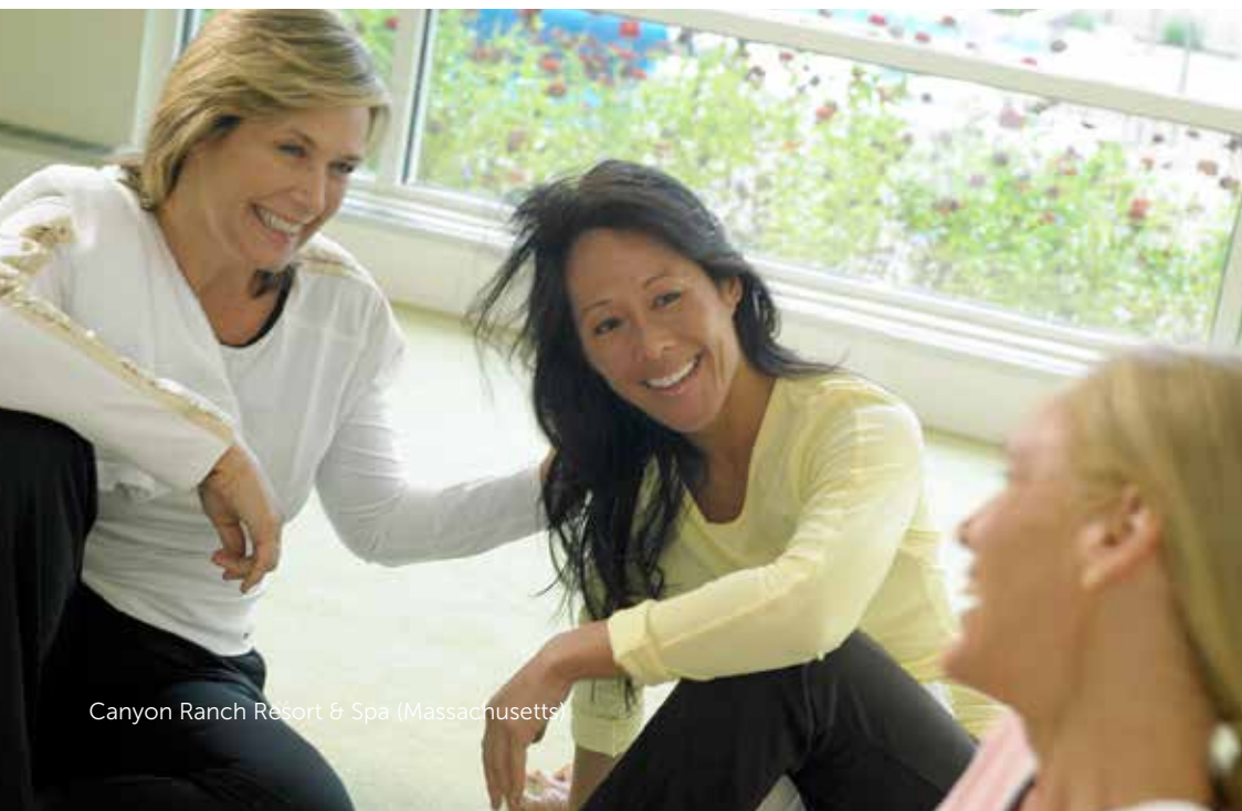
Canyon Ranch Resort & Spa (Massachusetts)

And for the “way out there” files, orgasmic meditation (or OM) has been making headlines for years (it was made for headlines), but is now expanding globally. At inhibition-shattering OM centers, women (lying in blanket “nests”) have their clitoris stroked by an OM partner for 15 minutes “in a non-sexual way,” with the goal of expanding the concept of sex, and