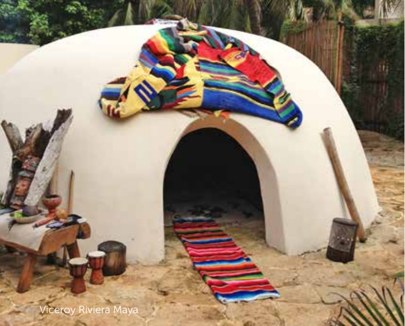
Viceroy Riviera Maya