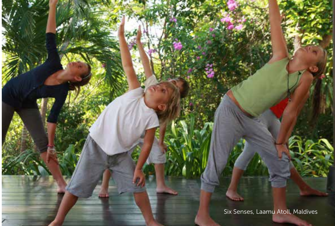
Six Senses, Laamu Atoll, Maldives

Yoga programs designed for children are offered in schools, community centers and wellness travel resorts around the globe.