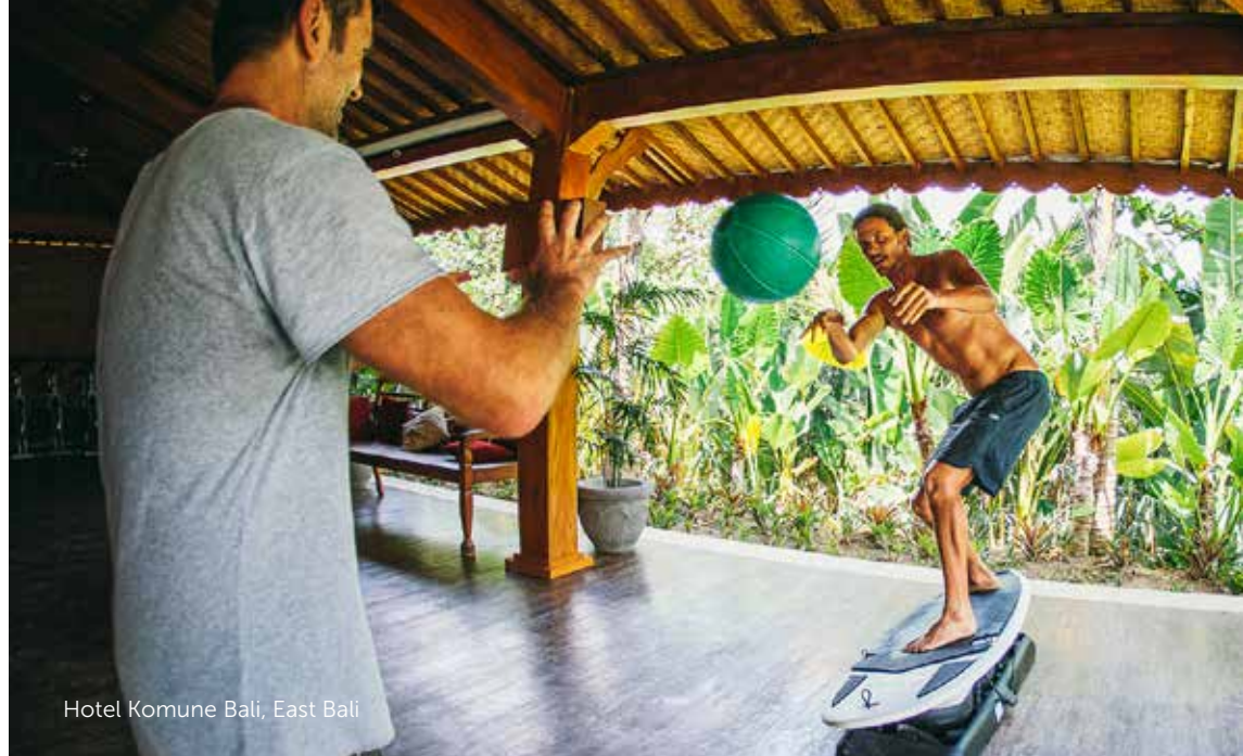
Hotel Komune Bali, East Bali

Hotel Komune's flagship Hotel Komune Bali represents the most evolved example of the surf-meets-wellness trend, marrying destination spa levels of wellness and fitness activities with one of the world's best surf breaks at Karamas Beach.