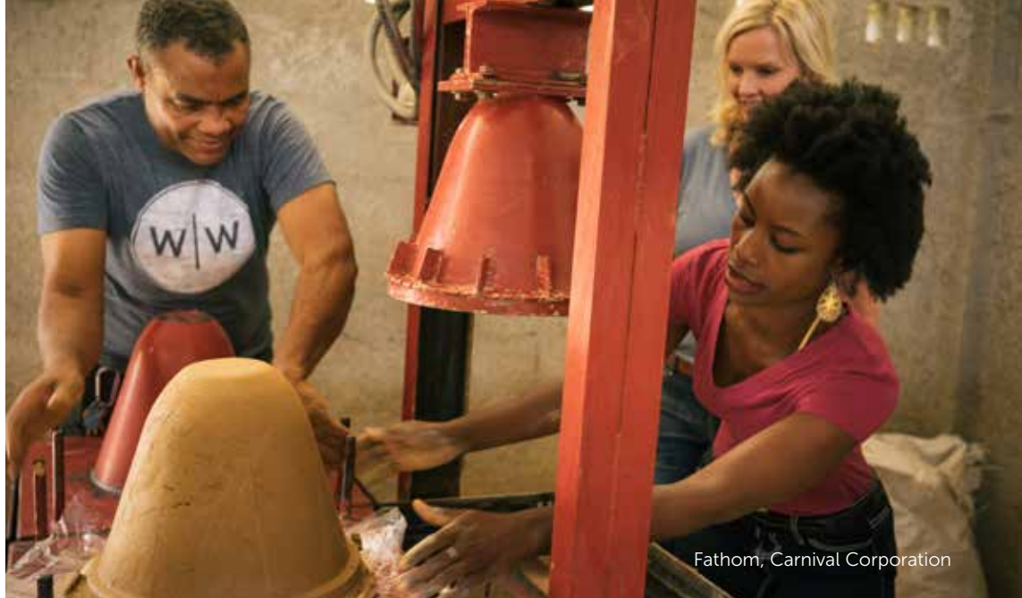
Fathom, Carnival Corporation

Sophisticated, healthy-minded travelers now demand several wellness travel components at the destinations they visit, including voluntourism. Carnival Corp.’s charity-conscious Fathom brand fuses travel with social responsibility.