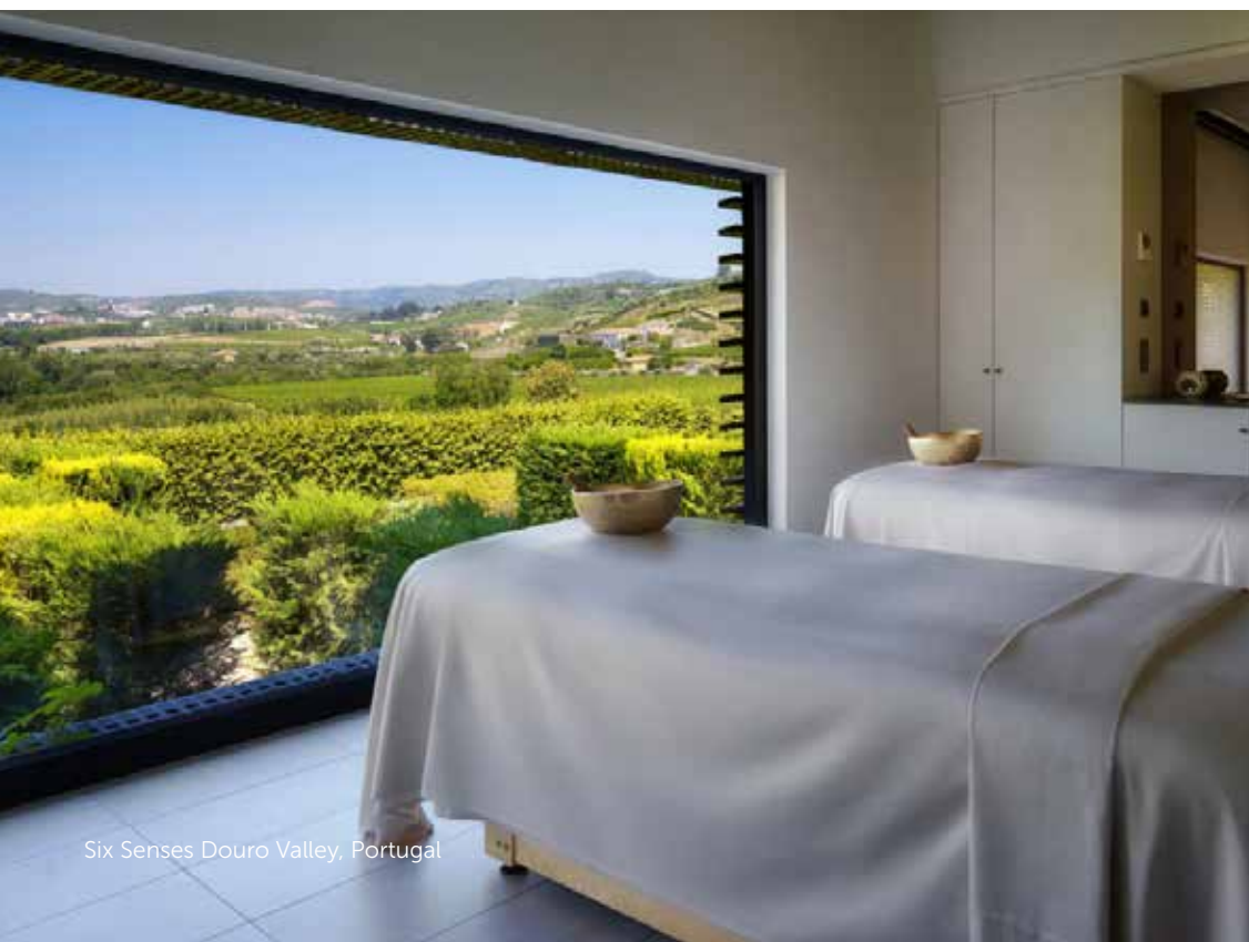
Six Senses Douro Valley, Portugal

Below are just a taste of examples and the trend's directions: from new properties striking the perfect balance between more extreme adventure and spa relaxation to established "mellow wellness" brands/