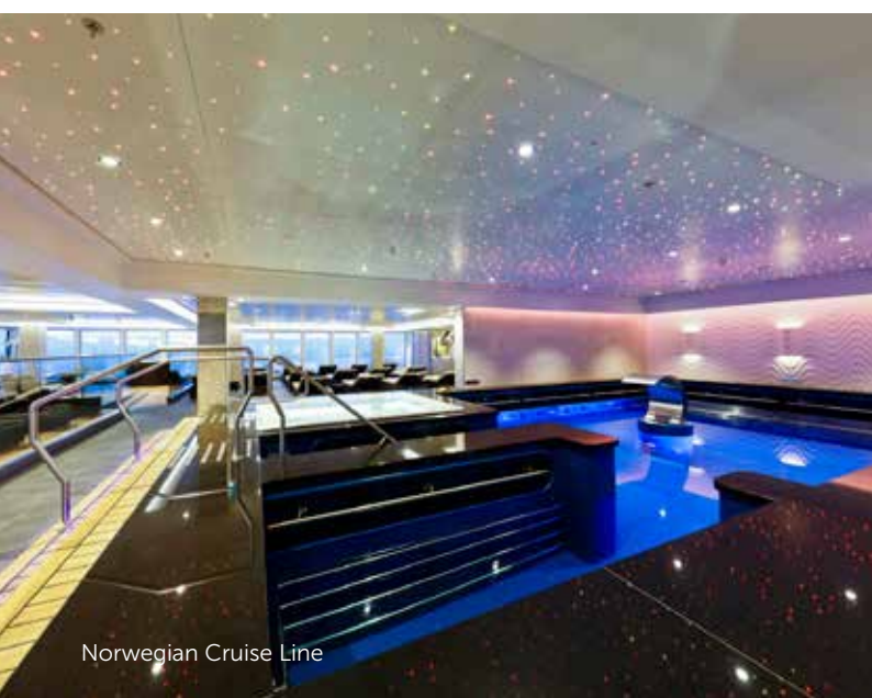
Norwegian Cruise Line

Additionally, travelers will find a lavish Canyon Ranch SpaClub aboard the equally luxurious Regent Seven Seas Explorer, which will sail its maiden voyage July 2016. Spa-goers will enjoy exclusive treatments developed by Canyon Ranch in collaboration with Red Flower; the menu of offerings—which draw inspiration from the seven seas of the modern world, with names like Red Flower Japan: A Revitalizing Ritual of the North Pacific and Red Flower North Atlantic Journey—is expected to expand across the fleet. Adding to the allure: hot and cold experiences, an infinity-edge plunge pool, chroma-therapeutic shower, private outdoor deck, full-service salon, and circular staircase that leads to the fully equipped fitness center.