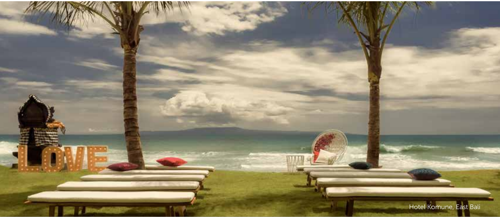
Hotel Komune, East Bali

“Let’s go surfin’ now, everybody’s learning how, come on a safari with me.”