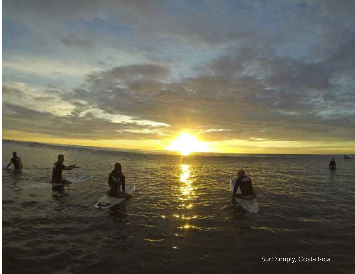
Surf Simply, Costa Rica

The all-inclusive Surf Simply (Nosara), takes surf coaching to another level for both beginners and the experienced—combined with yoga, massage and healthy meals.