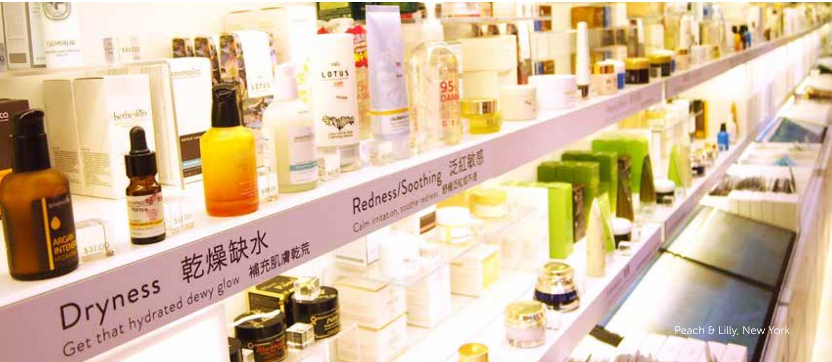
Peach & Lilly, New York

Two life-size cardboard cutouts of fresh-faced and stylishly coiffed South Korean boy band stars welcome guests at the entrance of Nature Republic's downtown Los Angeles store. But Nature Republic is not a music shop, or even a clothing brand. It's a major South Korean skin care and cosmetics line, one of many that is grabbing the attention of global style-watchers because of its quality, affordability, and colorful pop sensibility.