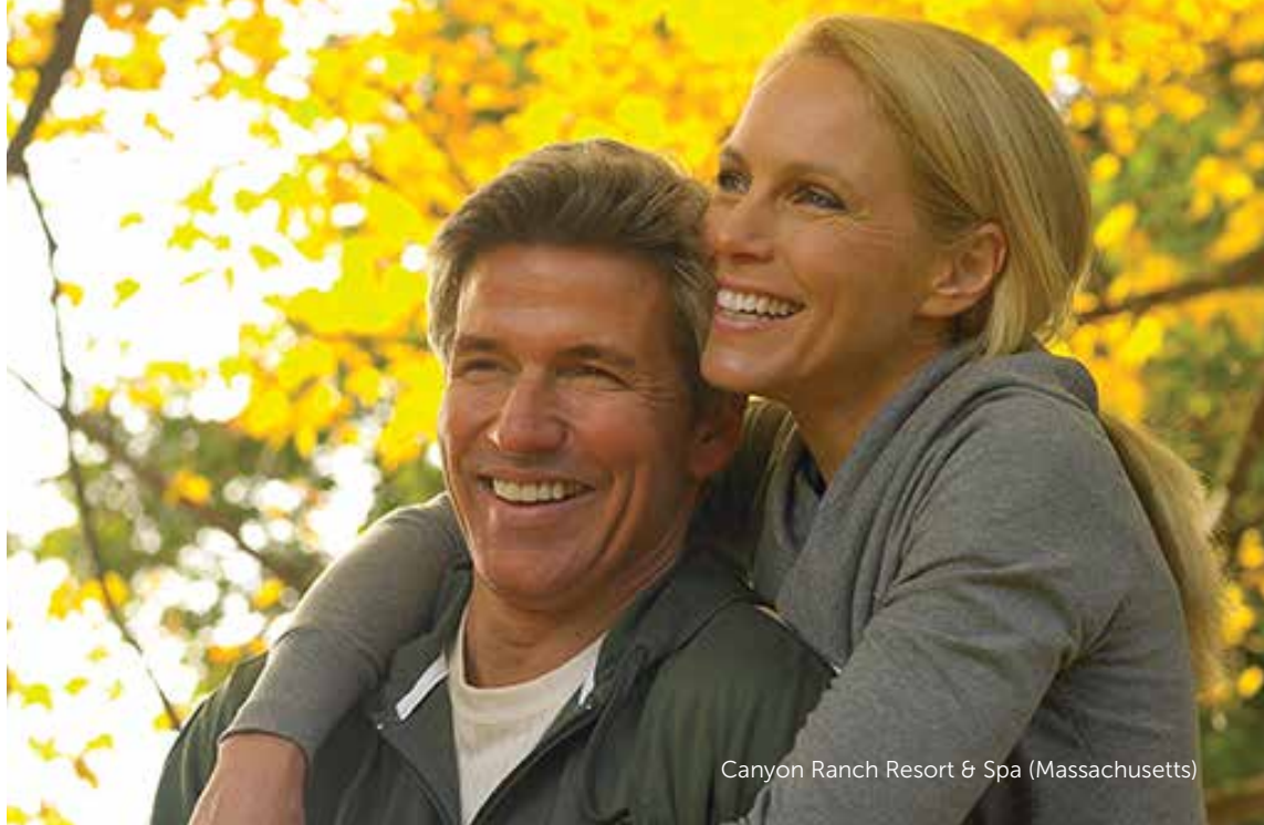
Canyon Ranch Resort & Spa (Massachusetts)

At the “Let’s Talk about Sex” event at Canyon Ranch Lenox , couples learn how to enhance or reinvigorate their sexuality with advice from experts.