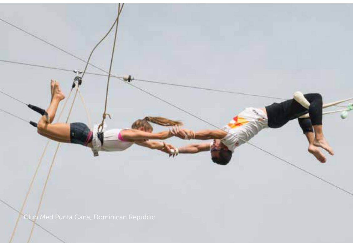
Club Med Punta Cana, Dominican Republic

At Hôtel Sacacomie (Quebec, Canada) you can try James-Bondesque "ice driving," and take a Porsche (with studded tires) out for a 150 mph "spin" across