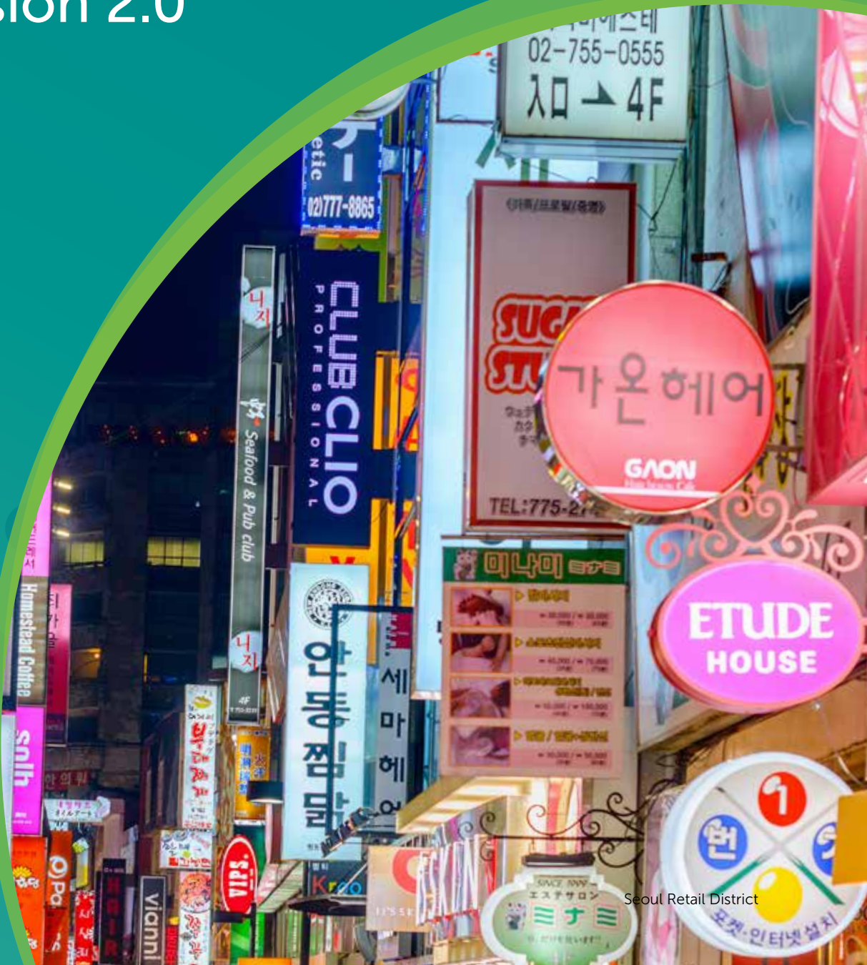
Seoul Retail District

Leading Korean companies launch 20 to 30 products per month. Compare that to Western brands, which release ten to 30 per year.